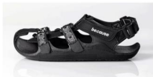
Shoes that Grow

We will be taking orders for bricks during the Lenten Season.